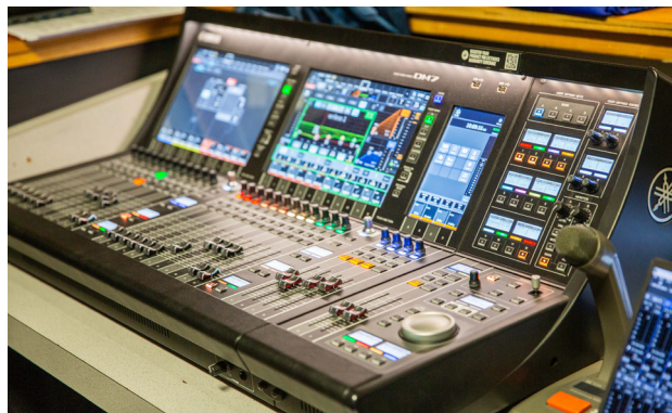
Yamaha digital mixing console