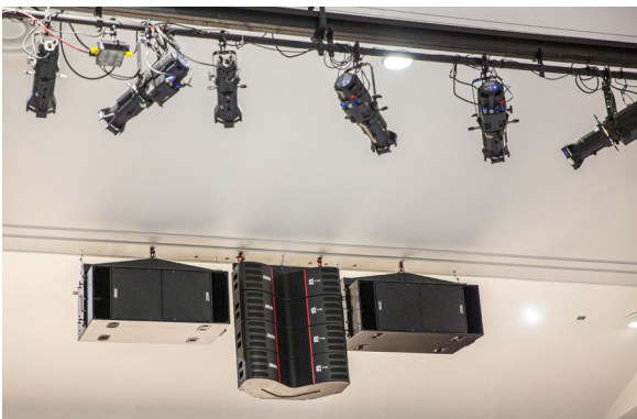
Main center loudspeaker array & subwoofers

To support the new system, the Intertech Ci team completed extensive conduit work and installed new cable pathways throughout the building. While time-consuming, this work ensured the auditorium could support modern, network-based audio and video distribution.